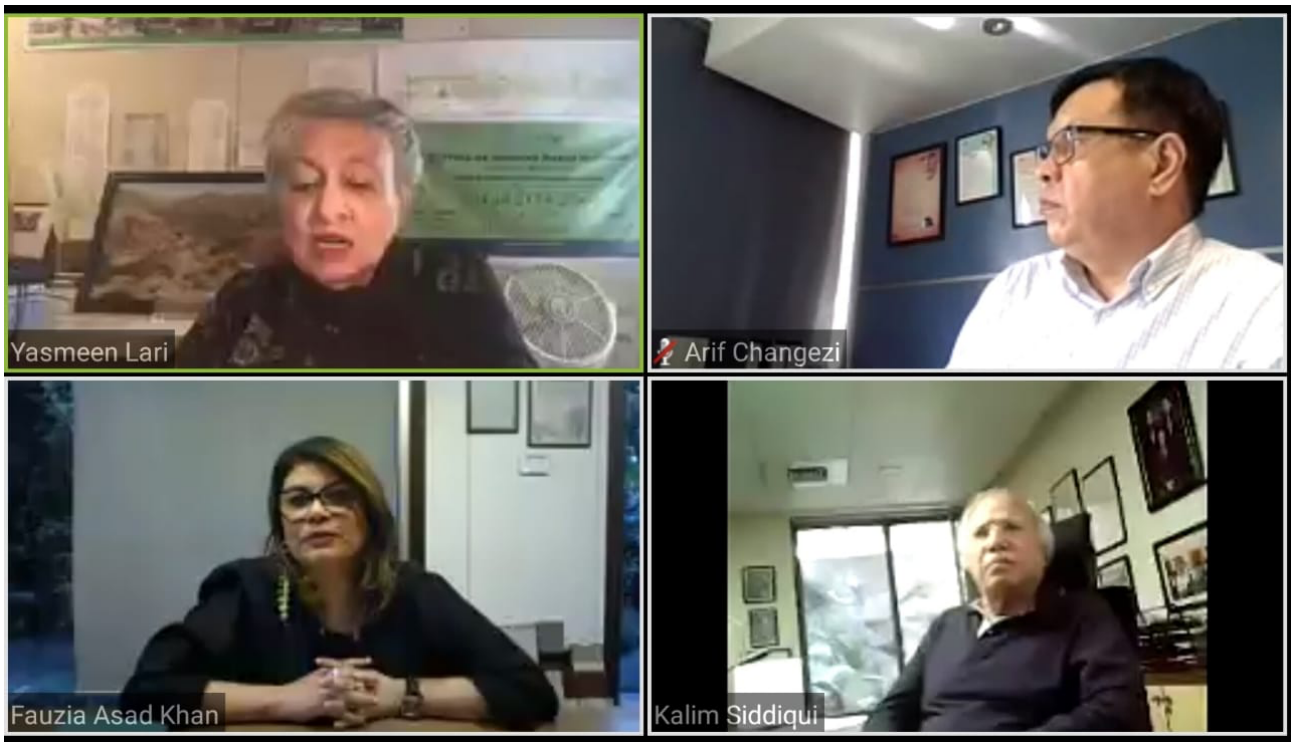
Zoom stills from Lecture 02.