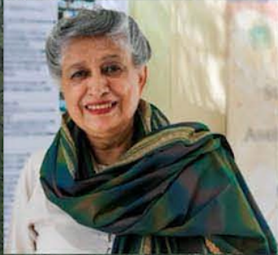
Ar. Yasmeen Lari CEO, Heritage Foundation / Founder Chair INTBAU Pakistan